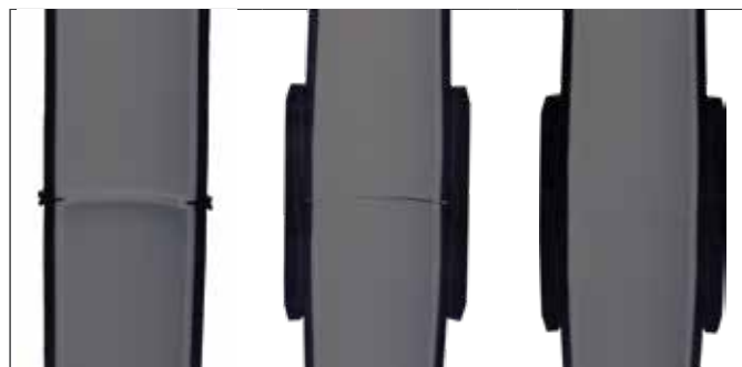
Heated element butt welding

MINELINE I has a white outer layer, but does not have an additional inner layer.