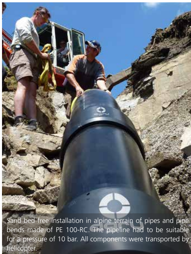
Sand bed free installation in alpine terrain of pipes and pipe bends made of PE 100-RC. The pipeline had to be suitable for a pressure of 10 bar. All components were transported by helicopter.