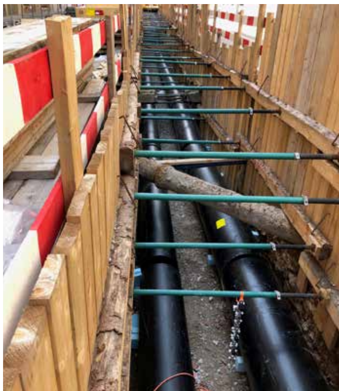
AGRU Kunststofftechnik supplied several hundred meters of PE 100-RC pipes in outside diameters between OD 560 mm and OD 710 mm for a new district cooling center in Vienna.