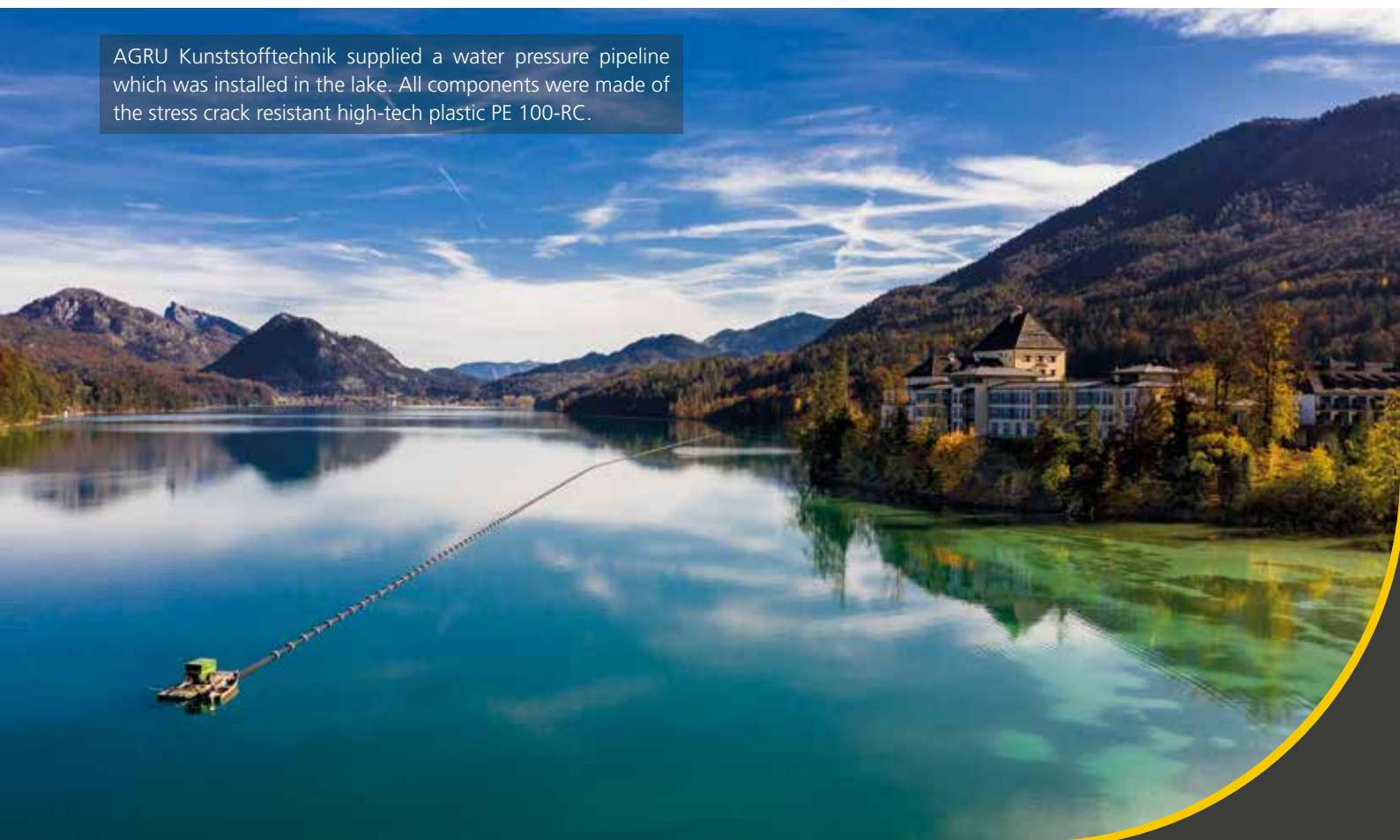
AGRU Kunststofftechnik supplied a water pressure pipeline which was installed in the lake. All components were made of the stress crack resistant high-tech plastic PE 100-RC.